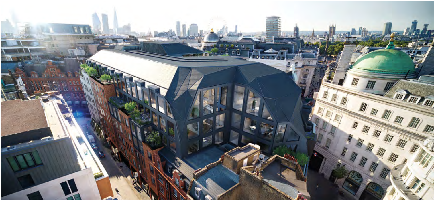
▲ Lucent, W1