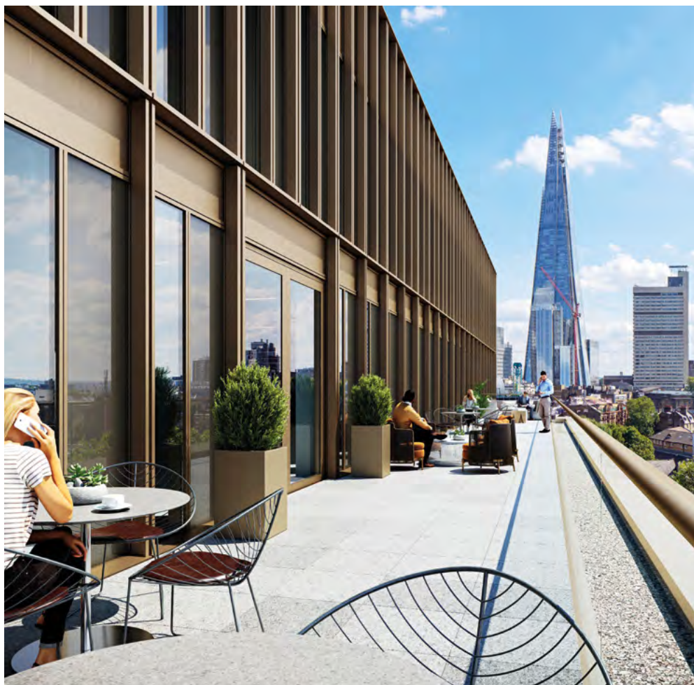
▲ The Forge, SE1

Our strong operational performance and continued progress on executing our strategy over the past year clearly reflects the capability and dedication of the substantial talent within Landsec. We continue to work on creating the right culture and a more diverse organisation, which is key in getting the most out of the valuable skills and expertise our teams harbour and in successfully delivering our strategy over time.