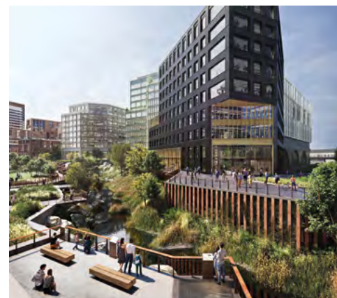
▲ Mayfield, Manchester

We remain on track with this plan and have now completed air source heat pump feasibility studies for six offices, with four progressing to concept design and two to detailed design. We have also completed the optimisation of building management systems for 11 offices, and will be completing this for two of our shopping centres this year. In addition, we have expanded our energy audits from 15 to 25 of our largest customers, which combined cover 19% of the energy use in our office portfolio. This identified potential annual carbon and costs savings of 10-15% per customer and we plan to expand this to the next 12 customers this year.