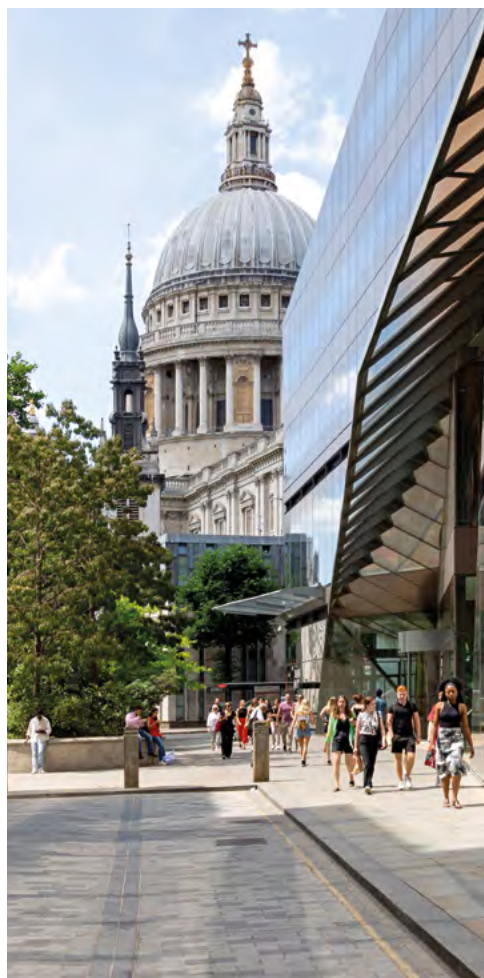
▲ One New Change, EC4

the next ten years, to empower 30,000 people towards the world of work and create £200m in social value. This includes a bursary programme that provides financial support to underrepresented young adults studying for a placemaking career, internships within Landsec and a small grants programme for local charities and community organisations in the areas we operate.