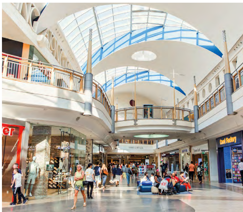
▲ Bluewater, Kent

In late 2021 we were the first UK property company to launch our fully costed net zero carbon transition plan. This plan will see us deliver our science-based target and meet the Minimum Energy Efficiency Standard of EPC B by 2030, with the expected cost for this already reflected in our current portfolio valuation. 36% of our portfolio is already rated B or higher, including 38% of our office portfolio. The latter is down from 44% last year, partly reflecting the sale of One New Street Square. We expect this to increase to 44% in the coming months once our current pipeline completes and this will increase further from 2025 onwards, as the benefits from our net zero transition investment kicks in.